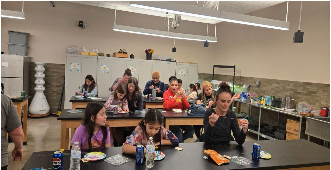
Students and families at the rope wrap earring class.