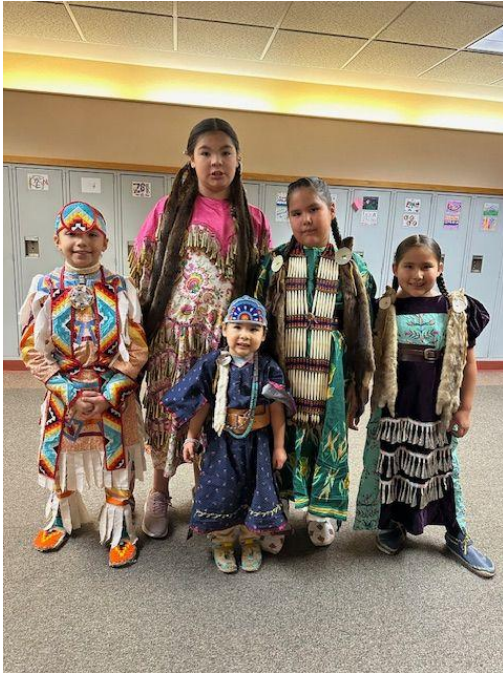
Paxson Culture Night