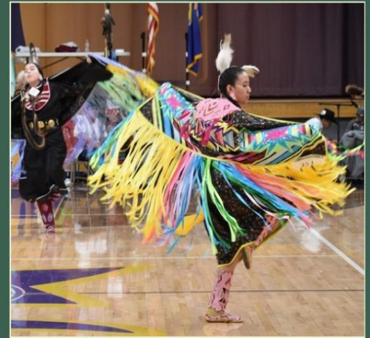
April 26, 2025 Sentinel High School